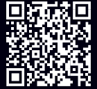
RUTM51 360° VIEW

The RUTM51 is a budget-friendly dual-SIM, multi-network industrial 5G router delivering connectivity for data-heavy applications. With five Gigabit Ethernet ports, dual-band Wi-Fi, and auto-failover, it ensures seamless, reliable performance. Backward compatibility with 4G Cat 12 and a versatile range of interfaces make the RUTM51 5G router a smart, future-proof choice for businesses seeking high-speed connectivity at a lower cost.